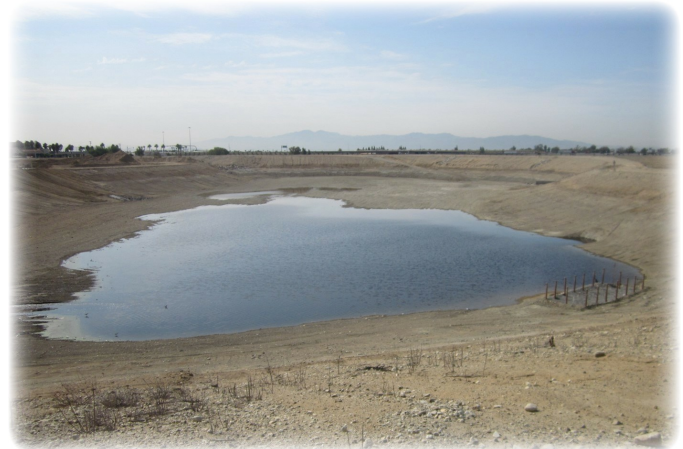
Turner Basin 4

Monitoring Activities. Watermaster and IEUA collect weekly water quality samples from recharge basins that are actively recharging recycled water and from lysimeters installed within those recharge basins. During this reporting period, approximately 184 recharge basin and lysimeter samples were collected and 27 recycled water samples were collected for alternative monitoring plans that include the application of a correction factor for soil-aquifer treatment determined from each recharge basin's start-up period. Monitoring wells located down-gradient of the recharge basins were sampled quarterly at a minimum; however, some monitoring wells were sampled more frequently during the reporting period for a total of 97 samples.