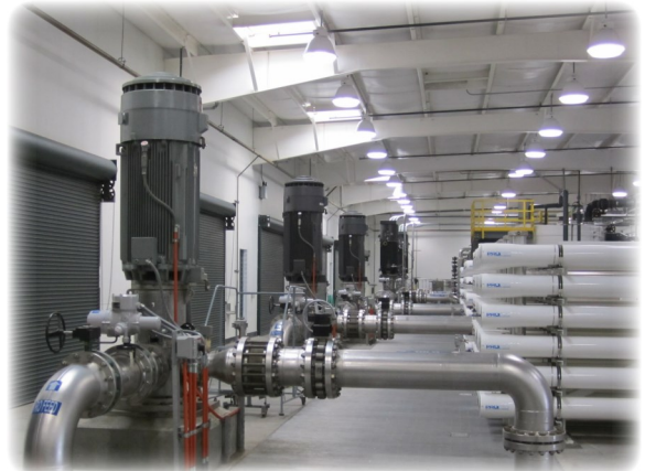
Chino Basin Desalter Authority Plant #2

All groundwater-quality data are checked by Watermaster staff and uploaded to a centralized database management system that can be accessed online through HydroDaVE SM . Groundwater-quality data are used by Watermaster for: the biennial State of the Basin report; the triennial ambient water quality update mandated by the Basin Plan; and the demonstration of Hydraulic Control—a maximum benefit commitment in the Basin Plan. Data are also used for monitoring nonpoint source groundwater contamination and plumes associated with point source discharges and to assess the overall health of the groundwater basin. Groundwater-quality data are also used in conjunction with numerical models to assist Watermaster and other parties in evaluating proposed groundwater remediation strategies.